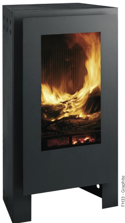
FH33 - Graphite